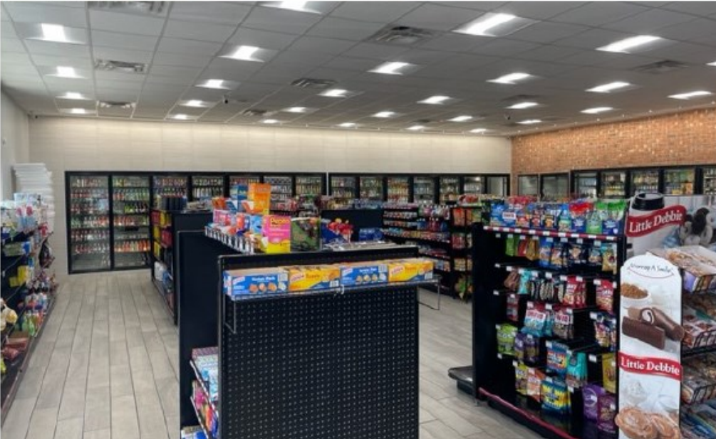
The information contained here-within this document is believed to be reliable, although Triple Net Investment Group makes no warranty or representation on the accuracy of the information. Please understand the property information is subject to change without notice. Buyer must verify all information and assumes all risk for any inaccuracies