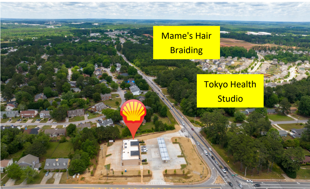
The information contained here-within this document is believed to be reliable, although Triple Net Investment Group makes no warranty or representation on the accuracy of the information. Please understand the property information is subject to change without notice. Buyer must verify all information and assumes all risk for any inaccuracies