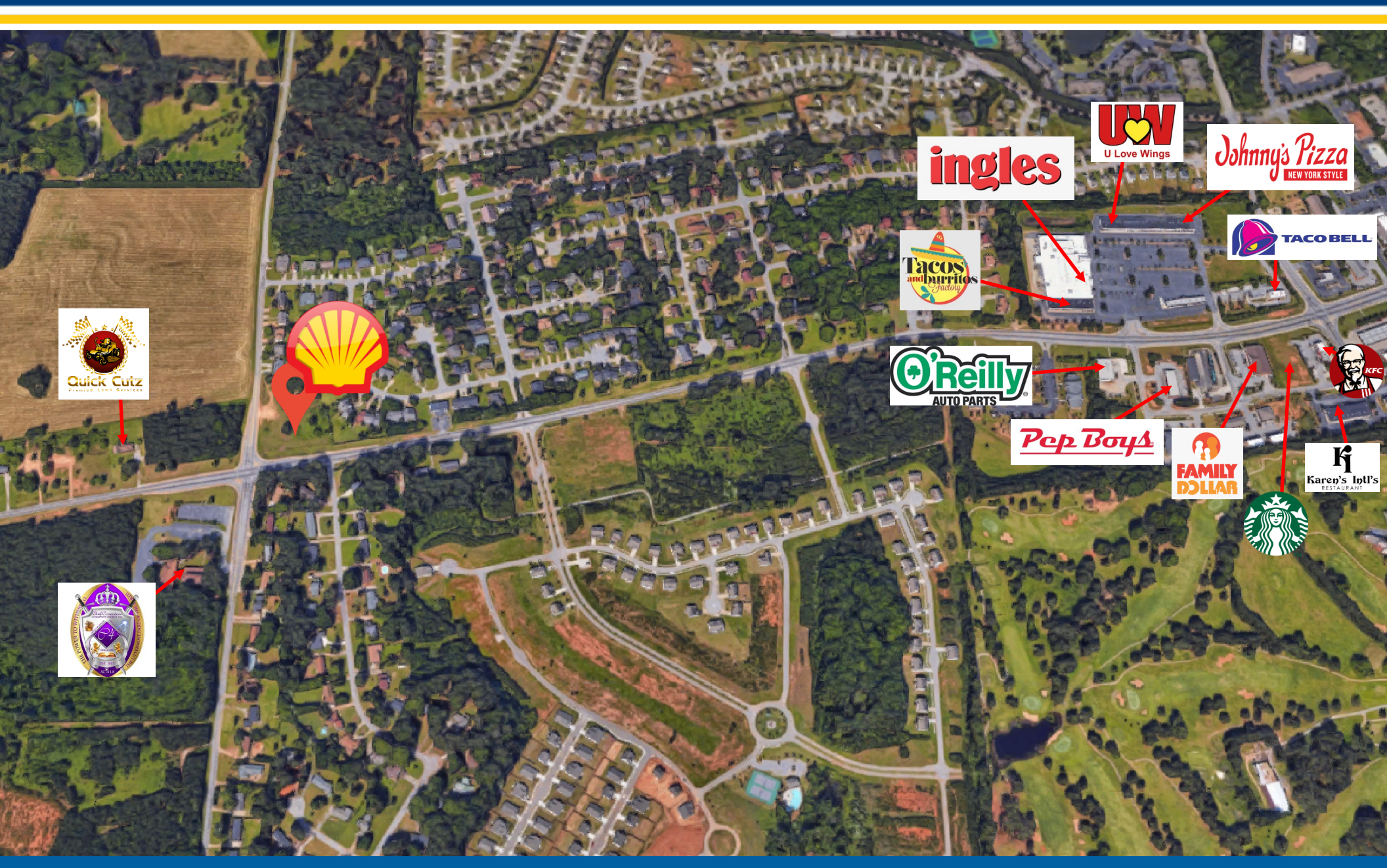
The information contained here-within this document is believed to be reliable, although Triple Net Investment Group makes no warranty or representation on the accuracy of the information. Please understand the property information is subject to change without notice. Buyer must verify all information and assumes all risk for any inaccuracies