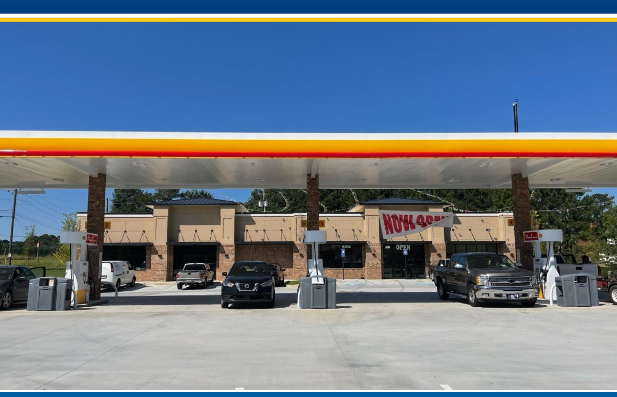
The information contained here-within this document is believed to be reliable, although Triple Net Investment Group makes no warranty or representation on the accuracy of the information. Please understand the property information is subject to change without notice. Buyer must verify all information and assumes all risk for any inaccuracies